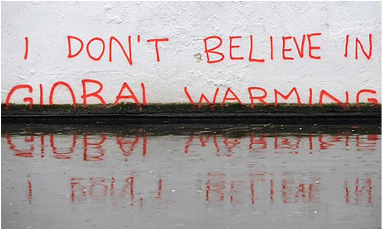
Banksy, Regent's Canal, North London